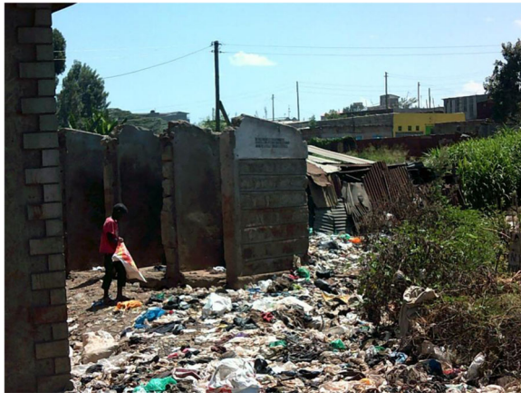
Fig. 5 Toilets without doors identified as high risk location for rape