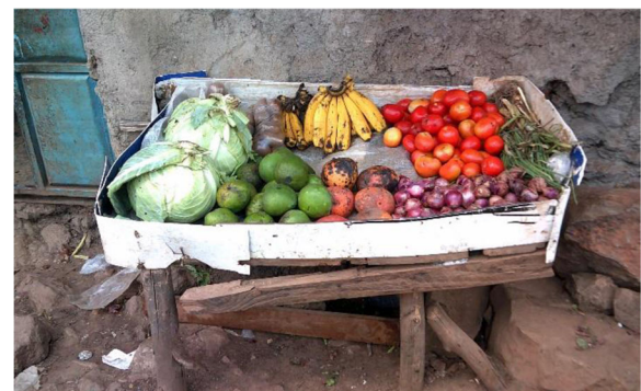
Fig. 9 Fresh fruit and vegetables for sale in Korogocho informal settlement, Nairobi

“It (selling fruit) is good because it improves our livelihood as people of Korogocho, through giving us a living and hence good lives.” Youth photographer caption