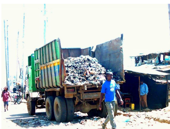
Fig. 8 Lorry collecting rubbish.

In fact, some respondents identified that despite devolution of decision-making providing the opportunity for counties to address the underlying causes of ill health, such as poor sanitation and clean water supply, these actions were not considered politically appealing. As a result, county governments prioritised visible interventions such as construction of hospitals. This has been described more fully elsewhere [18].