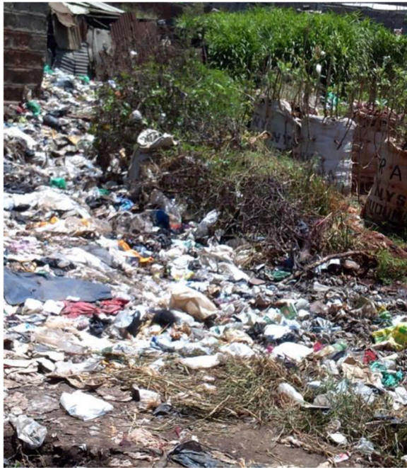
Fig. 7 Rubbish discarded within Korogocho informal settlement.

“A lorry that collects garbage... I loved it, because the people collecting the garbage are the youth.... [so] the community becomes clean.” Youth photographer FGD