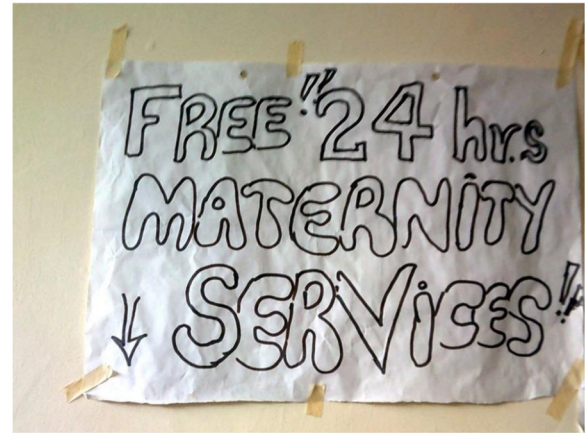
Fig. 6 Sign advertising free maternity services at newly built government health facility in an informal settlement, Photographer Mary Wanjiku

women and children rather than men, which created a barrier to them seeking help when needed. Meanwhile within Nairobi drug and gang-related violence among young men was highlighted.