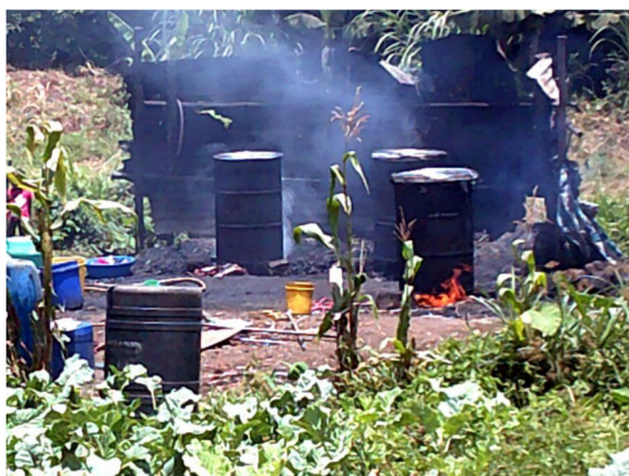
Fig. 3 Chang’aa brewing

Youth photographers highlighted that age, limited social capital, poverty, and limited education can converge with location when orphans and other vulnerable children live within an informal settlement, resulting in these children and youth experiencing limited employment opportunities; this lack of power to choose their livelihood leads to these children being obliged to so scavenge for plastics to recycle in order to earn an income for the family (see Fig. 4).