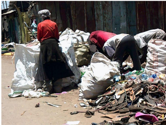
Fig. 4 Searching for plastic to recycle

According to policy, representatives for youth (and women and people with disabilities) should be invited and given opportunity to participate during community meetings for decision-making. None of the youth photographers described having participated in these meetings (although this was not explicitly probed). Due to the lack of ‘youth friendly’ services, youth did not attend for health education or for services at the health facility as frequently as needed, increasing their vulnerability, with girls and young women in particular at risk of teenage pregnancy, due to a lack of the needed health information and the need for youth specific sexual health education. Youth photographers expressed appreciation for the work which CHVs carry out and highlighted how they encourage attendance for health services.