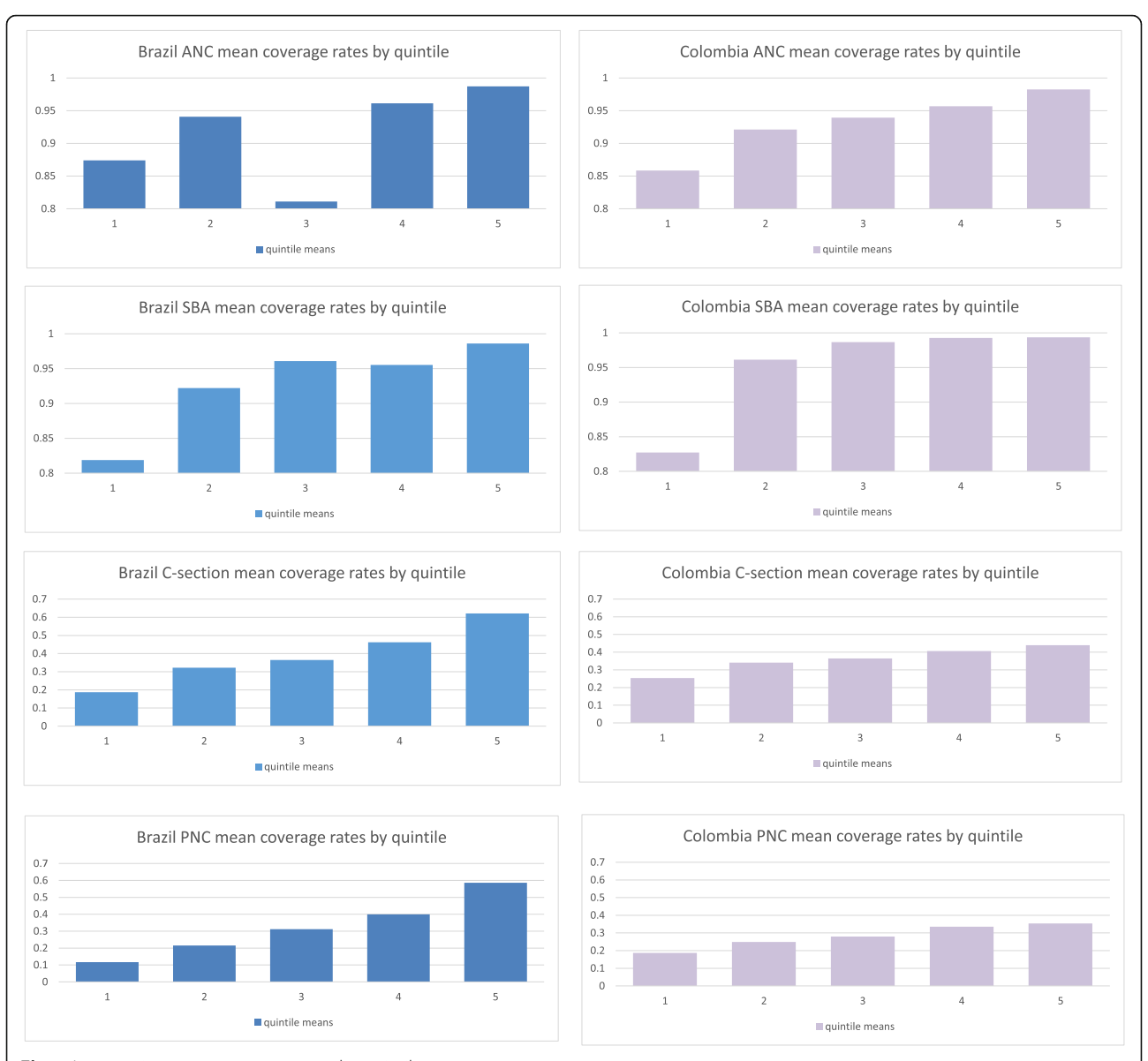
Fig. 1 Intervention mean coverage rates by quintile Coverage rates in the vertical axes ranges from 0 to 1 however to facilitate visual presentation only part of the scale was shown (from 0 to 0,8 or from 0,8 to 1) to highlight differences in coverage across quintiles. SBA, skilled birth assistance; PNC, postnatal care

coverage, there seems to be persistent pro-rich inequity of access for these interventions in both countries. Finally, the results of our decomposition analysis of the inequities in access to SBA and PNC in Brazil suggest that wealth inequalities, regional inequalities, inequalities in access to private hospitals, and inequalities in access to private health insurance explain the bulk of the inequities in access.