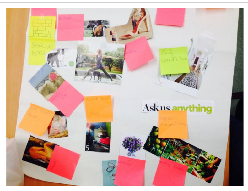
Fig. 1 PLA chart after flexible brainstorming

to the research sessions [73]. The core research team met regularly to discuss the work, with research notes, transcripts and reflective debriefing notes being circulated and discussed. Designated research data analysis sessions took place to discuss emerging findings across the six marginalised groups.